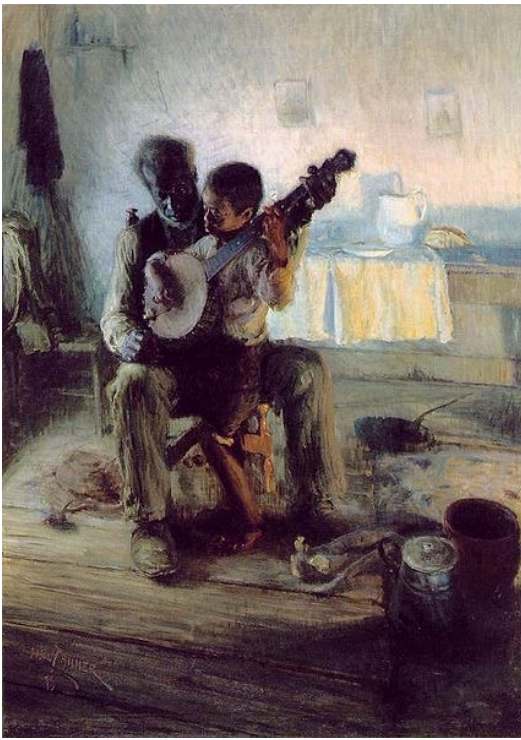
Henry Ossawa Tanner. The Banjo Lesson, 1893. Oil on canvas. 123.4 x 90.17 cm. Hampton University. Hampton, Virginia