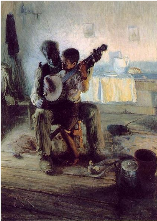
Henry Ossawa Tanner. The Banjo Lesson, 1893. Oil on canvas. 123.4 x 90.17 cm. Hampton University. Hampton, Virginia