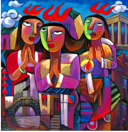
He Qi. The Holy Spirit Coming. www.heqigallery.com